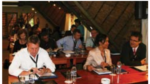
Participants at the "Aerospace Technology – Enhancing our Partnerships" special session, hosted and organised by AeroAfrica-EU on the first day of IASSA 2009.